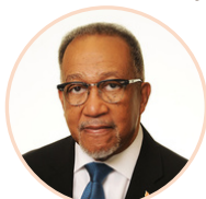
Dr. Ben Chavis Co-Founder