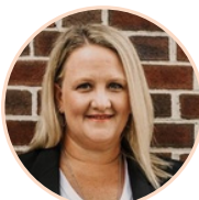
Kim Crawford Macy's